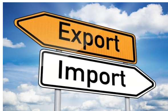
Figure 1: Goods Imported and Expectations

While all countries benefit from close ties, the people of the United Kingdom decided to leave the European Union because their economy was under pressure, (Sampson, 2017). The EU member countries were drawn to the UK because it was the hub of economic activity and a hub for the global industry. Consequently, Brexit poses a greater threat to the United Kingdom than any other EU member state. TESCO Plc. does most of its business in the United Kingdom, although it also has operations in other countries. As a result, the firm may no longer be able to hire workers from other EU nations.