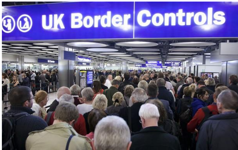
Figure 3: Immigration in the Workforce