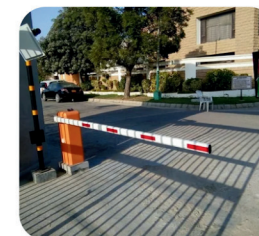
AUTOMATIC BARRIER GATE