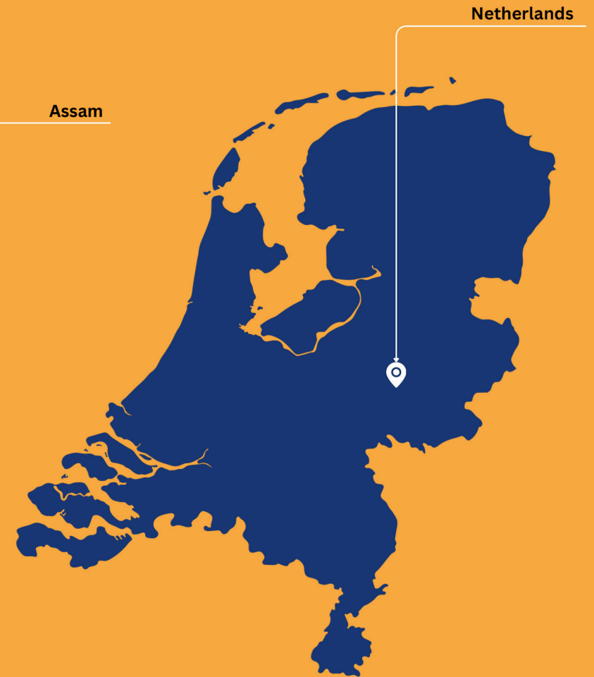
IN THE WORLD